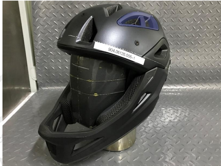
904.06126.006 – LT1701-MTB ENDURO 3.0 (Multi)